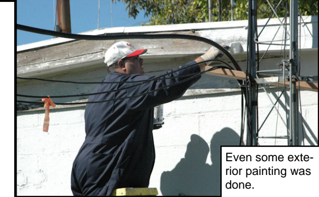
Even some exterior painting was done.