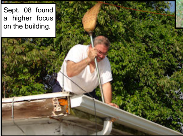
Sept. 08 found a higher focus on the building.