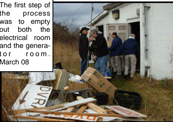
The first step of the process was to empty out both the electrical room and the generator room. March 08