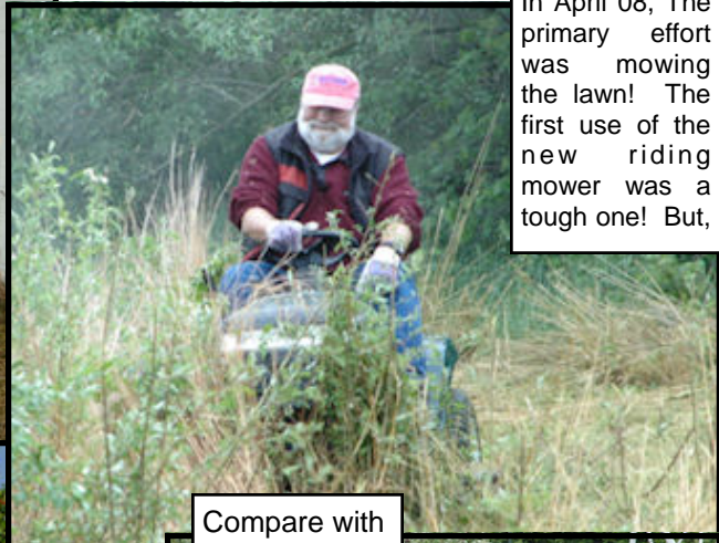
In April 08, The primary effort was mowing the lawn! The first use of the new riding mower was a tough one! But,