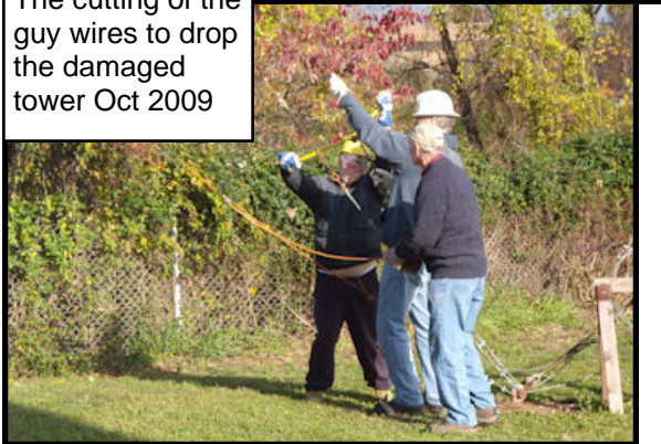
The cutting of the guy wires to drop the damaged tower Oct 2009